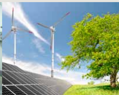
ELECTRICAL ENERGY FROM RENEWABLE SOURCES