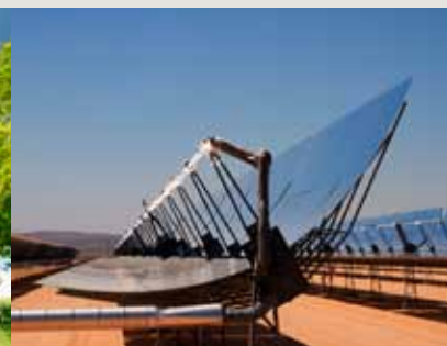
HEAT ENERGY FROM RENEWABLE SOURCES

EFFICIENT AND INNOVATIVE TECHNOLOGICAL SOLUTIONS